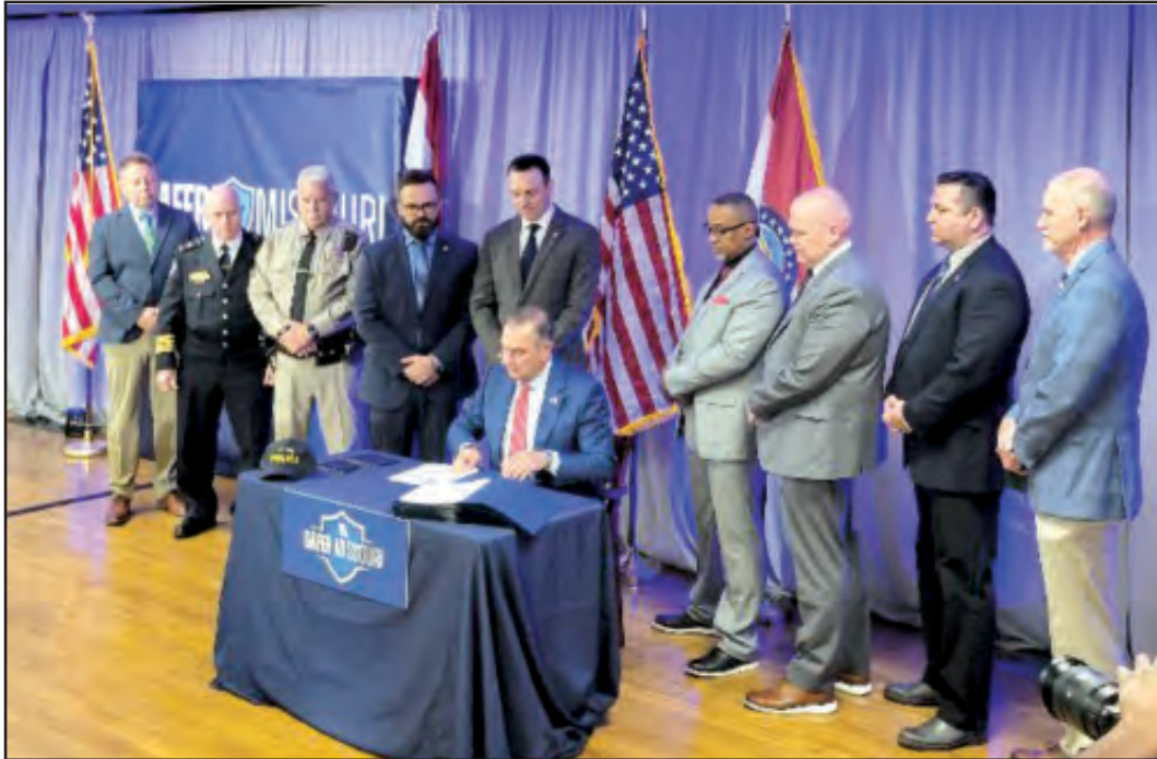
Governor Mike Kehoe at a ceremonial signing at the SLPOA Hall

On Wednesday, March 26, 2025, Governor Mike Kehoe signed HB495 into law. HB495, otherwise known as the state control bill, returns control of the St. Louis Metropolitan Police Department to a Governor appointed Board of Police Commissioners made up of the Mayor, four local St. Louis City citizens and one additional non-voting member. This sixth member will be an ex-officio member who is required to own a business within the City of St. Louis and live within a 50-mile radius of the City.