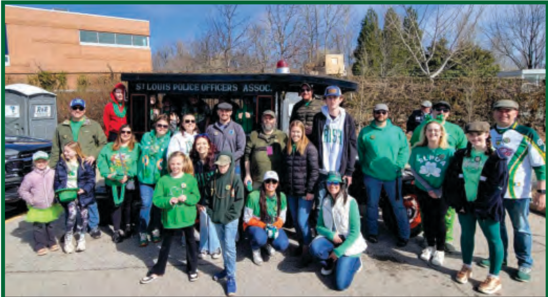
2025 Dogtown St. Patrick's Day Parade