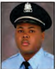
Daryl Hall 2011