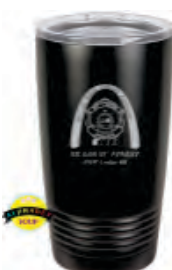
(Sample of Available Products)