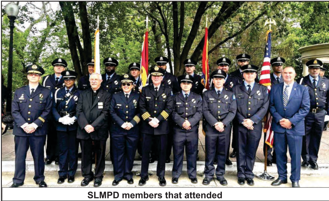
SLMPD members that attended

As always, please be assured of my prayers for you, your families and loved ones. May God bless all of you, and may God give eternal rest and peace to the officers who have died in the line of duty.