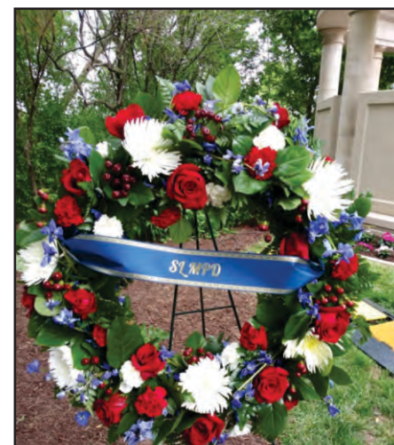
Wreath presented by the SLMPD