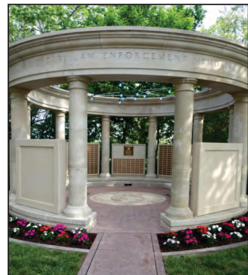
Missouri Law Enforcement Memorial on the grounds of the capitol