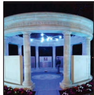
Memorial lit with blue lights