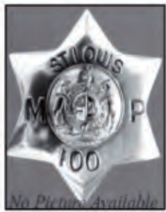
JULIUS PETRING 1917