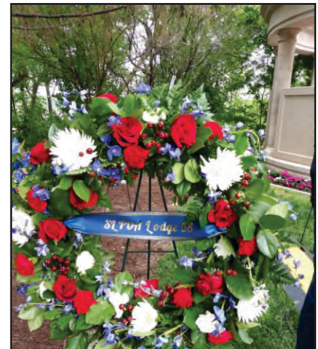
Wreath presented by the SLPOA