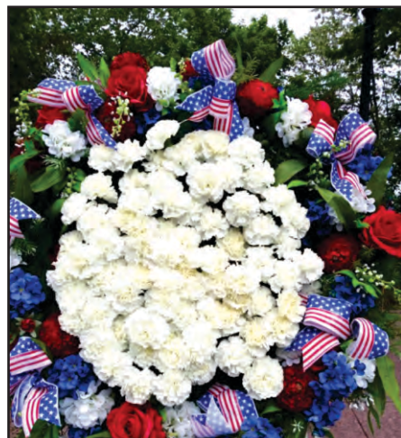
Memorial Wreath-Family members of deceased officers placed flowers in the wreath.